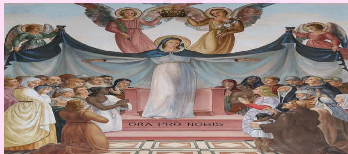
Blessed Virgin Mary, Mother of the Church Feast Day - June 9th

Offertory $ 1,748.75 2nd Collection/Building Fund $ 420.35