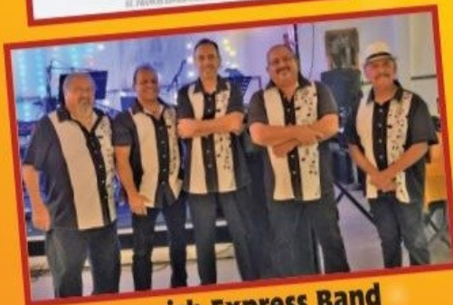
Spanish Express Band