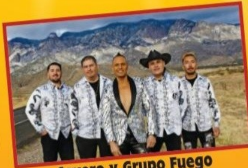
Severo y Grupo Fuego

For more info., call Jamie at (719) 250-6630 or Parish Office (719) 564-1125