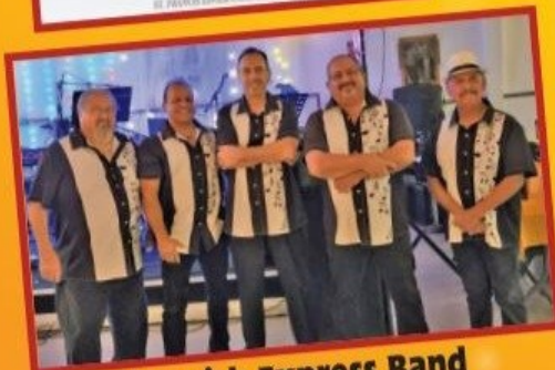
Spanish Express Band