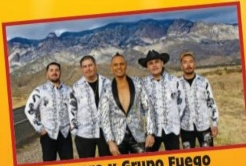
Severo y Grupo Fuego

For more info., call Jamie at (719) 250-6630 or Parish Office (719) 564-1125